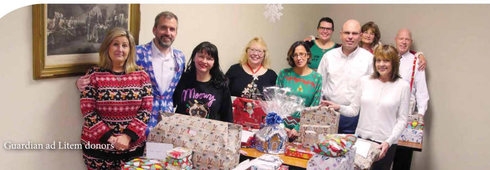
Guardian ad Litem donors

When you or your loved one is no longer able to live at home safely, our team is able to help you and your family make the correct health care, placement, legal and financial decisions. Please give us a call if you need help with your aging loved one.