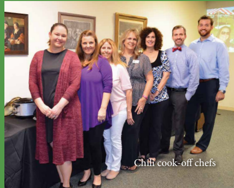
Chili cook-off chefs

table to taste the winning recipe! For more information, visit www.chiliblaze.com .