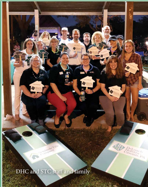
DHC and STC Staff and family

DeLoach, Hofstra & Cavonis, P.A. and Seminole Title Company have been supporting Music in the Park since its inception 21 years ago. The law firm and title company enjoy being a part of such a great community and the music series is just one of the many reasons why Seminole is a premier place to live, work, and play. This free music series is organized by the City of Seminole Recreation Department and runs for six consecutive Fridays with entertainment from around the Tampa Bay area. This year's series concluded with a high energy and exciting performance by Sounds of Soul. The staff and family members danced to the hits of Motown in our pavilion, visited with attendees and clients, and had fun playing with our new corn hole boards. Please be sure to stop by and see us next year!